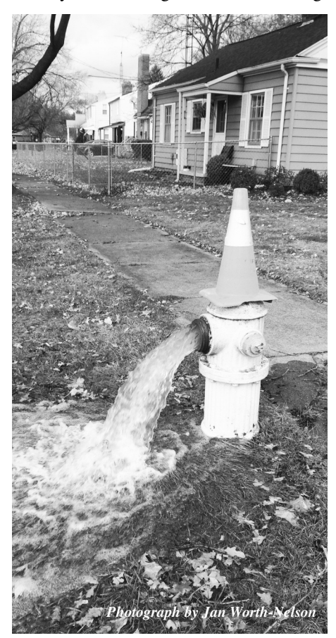
Familiar Flint sight

The EPA advises that unfiltered water is okay for washing hands and bathing,