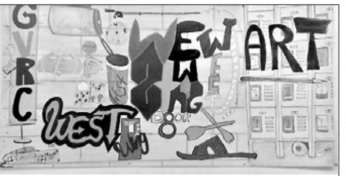
Welcoming mural at Buckham

say, the workshops only became gendergeared as it emerged that girls had particular needs to express themselves while detained. Boys needed expression too, but their avenue of choice tended toward the visual arts. During sessions there is no talk about charges or cases; instructors strive for an atmosphere of freedom to work in the arts.