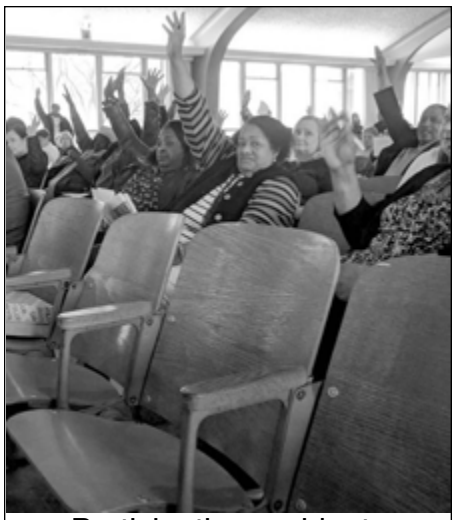
Participating residents

amendments would open up larger industrial areas, such as the former Buick City site, to be used for all aspects of medical marijuana including research, growing, processing, and dispensing.