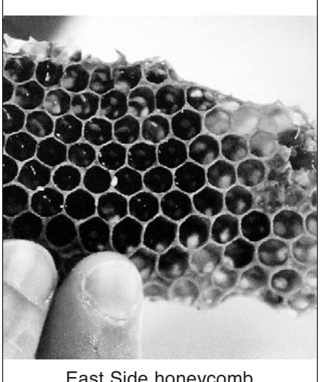
East Side honeycomb

holes. Both the manufactured combs and the ones the bees make have holes that are on a downwards slant so that the honey doesn't run out if it becomes thin, like on a hot day. But the bar hives won't produce collected honey easily.