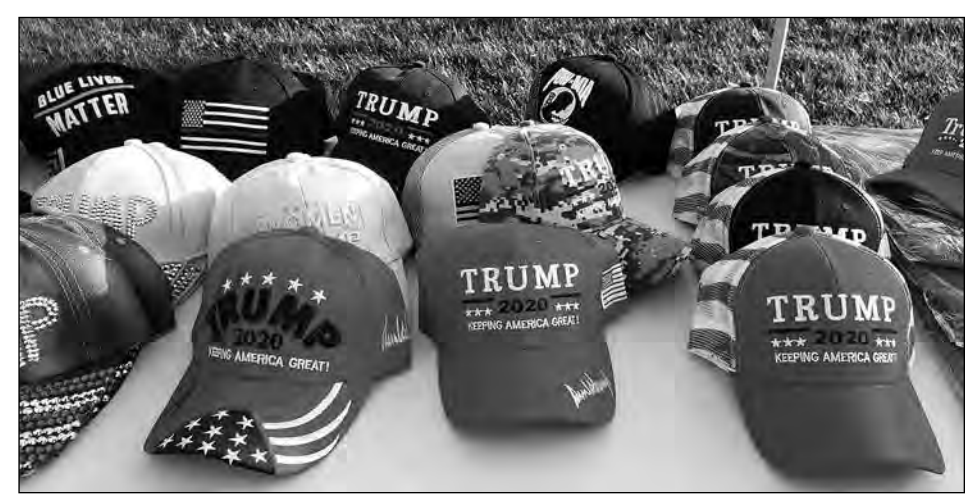
Trump merchandise at a Vice President Mike Pence 2020 campaign stop at Bishop Airport in Flint

mary season and move to the national conventions this summer, Trump will also be on track for a series of court appearances that could result in criminal convictions and prison time as he faces 91 criminal charges on both the state