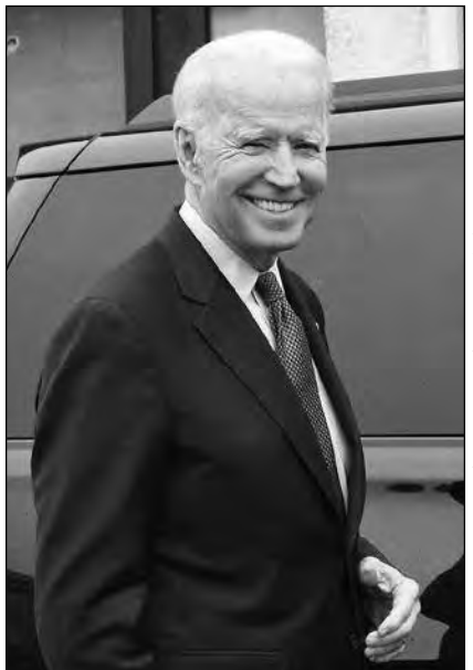
President Joe Biden outside of Berston Field House in Flint during a 2020 campaign stop

Pundits are searching for new adjectives to describe the upcoming 2024 presidential election. 'Historic' and 'unprecedented' are among the most common, but both seem inade-