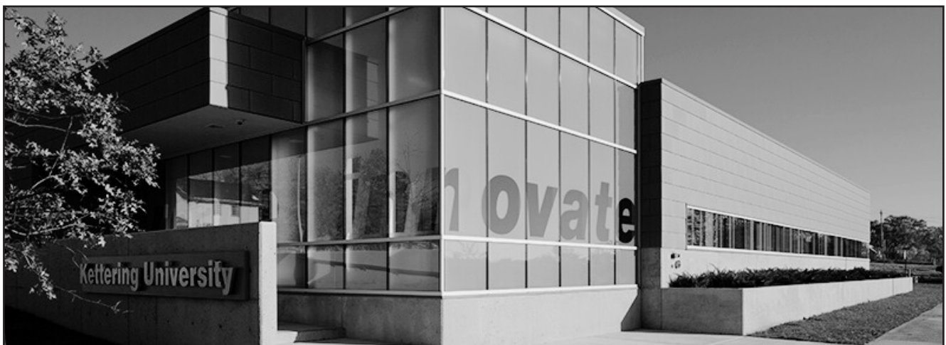
The Innovation Center on Bluff Street at Kettering University

When reached for comment on the current situation, Rebecca Norris with Kettering’s media relations team responded, “Right now we are looking for guidance when it comes to these grants and are not able to provide a response.” ●