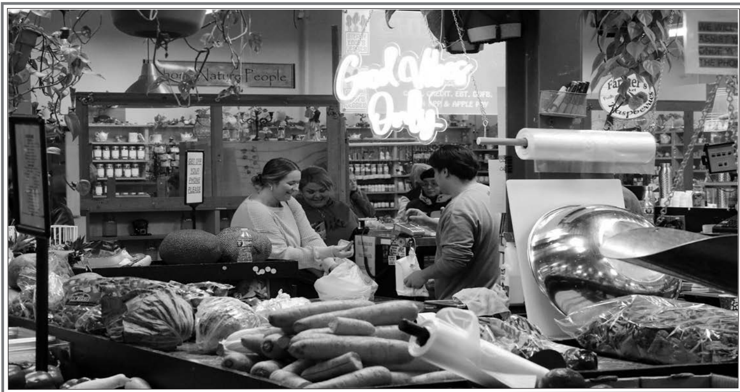
Photo of the Month: Shoppers at the Flint Farmers' Market.