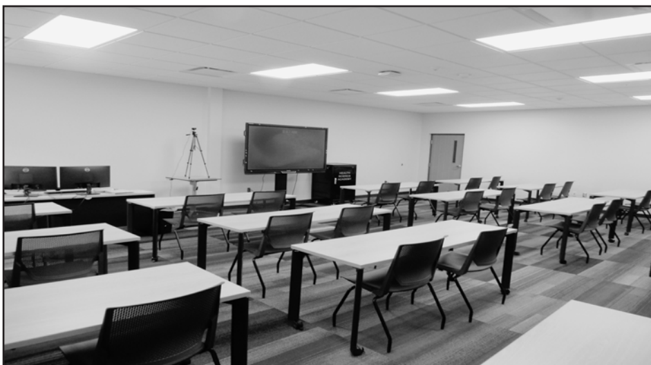
One of two newly remodeled classrooms in the Beecher High School “Old Building.”

“They'll leave high school with some sort of certification that will provide a foot in the door to employ-