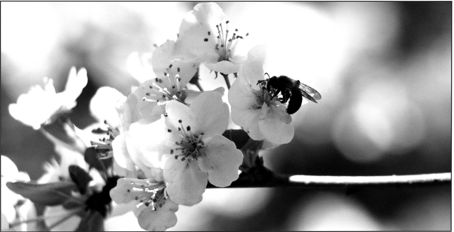
Photo of the Month: A busy bee in a Crapo Street apple tree.