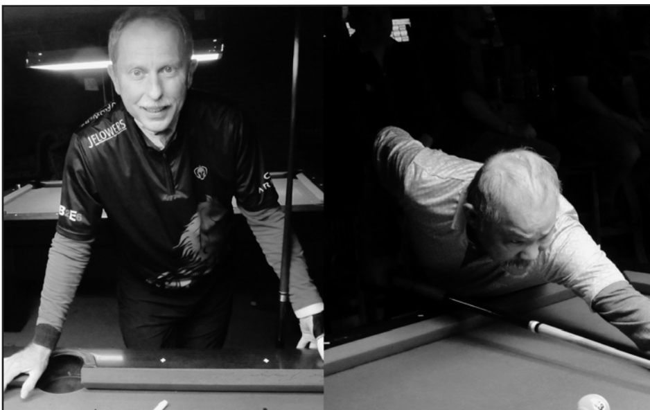
Billiards legends Earl Strickland (left) and Efren Reyes (right) came to Flint for a ten-ball match at Grindstone Billiards Club on May 14, 2026.

While we can’t be sure what the future holds for Reyes and Strickland, one thing for certain is that those lucky enough to attend the May 14 event in Flint were treated to quite an impressive show from the two billiards legends. ●